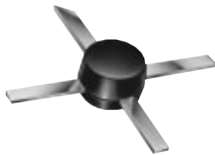
CASE STYLE: VV105